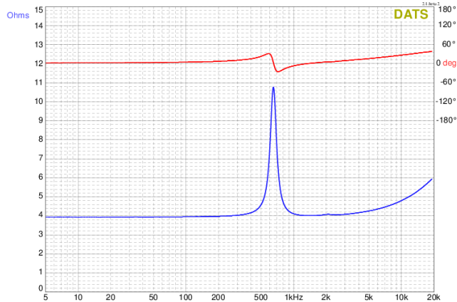
Measurement taken with transducer uncoupled facing upward.